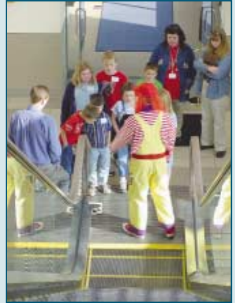
Safe-T Rider® presentations

O ne hundred and forty nine years ago, when Elijah Otis invented the safety elevator and 110 years ago, when Jesse Reno invented the escalator, I am sure they would never have believed that today there would exist an organization whose sole mission was to educate the public on the safe and proper use of their inventions. The Elevator Escalator Safety Foundation (EESF) has promoted the National Elevator Escalator Safety Awareness Week for the past nine years. The occasion is celebrated annually on the second full week of November. This week is dedicated to spreading the safety message to the public. Many organizations, companies and individuals throughout the country are committed to keeping their communities safer by promoting elevator and escalator safety and striving to maintain our industry's low accident record.