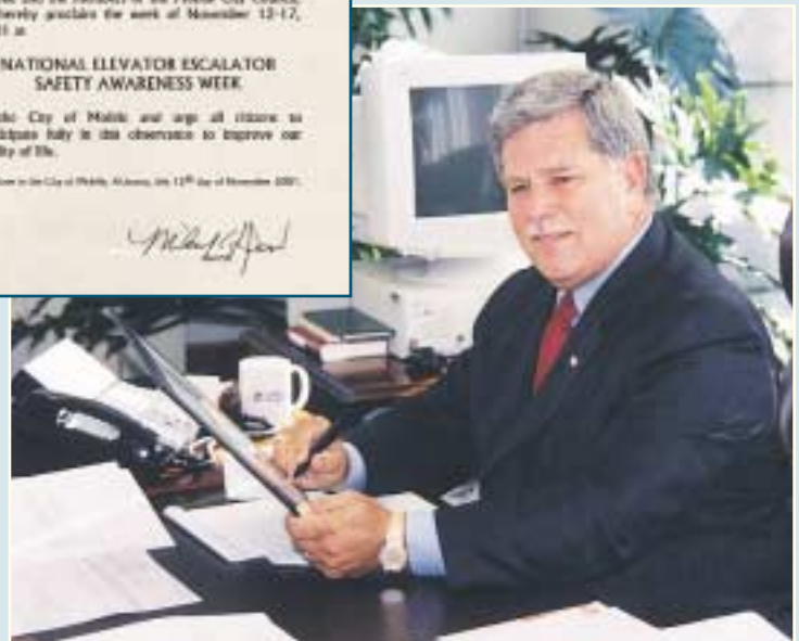
Mayor Mike Dow of Mobile, Alabama