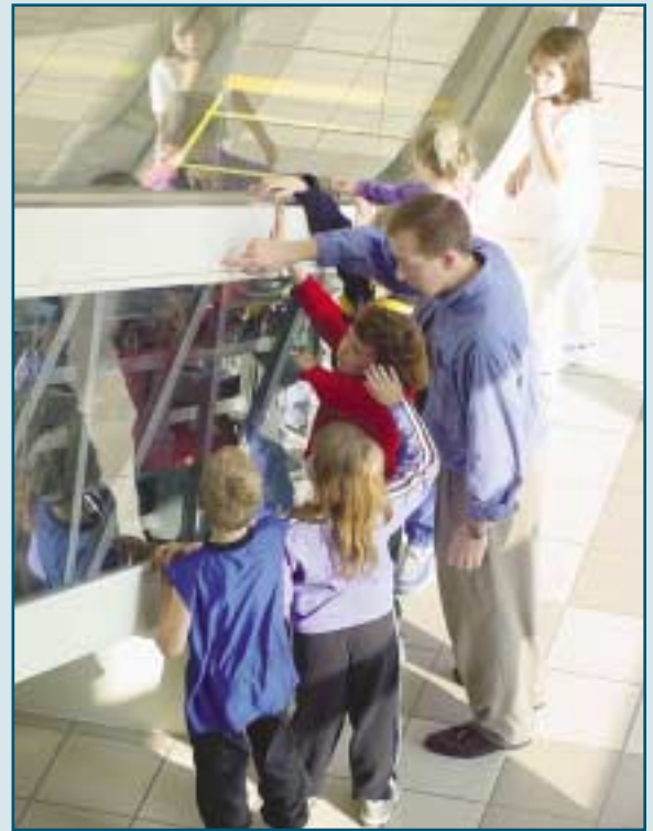
Demonstration of working escalator

office "spokesperson" for Safety Week. The students were also given small group tours of Fujitec's 15-story research tower, which is one of the most visible buildings in Warren County. Inside the research tower, Fujitec employees, many of whom volunteered to help the students, demonstrated the proper use of an actual working escalator and elevator. Following the demonstrations each second grader had the opportunity to tryout the new safety skills that were learned in the program.